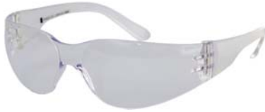
GLAM110SC Child's safety glasses

Children's Clear Lens Glasses Wrap-around, scratch resistant, 99% UV Resistance.