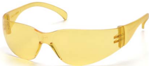
GLAM130S Amber lens safety glasses