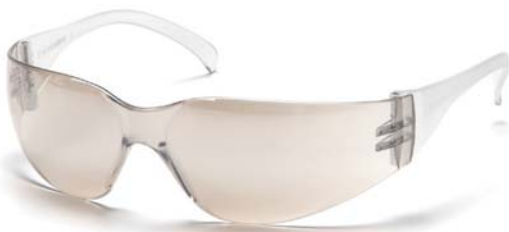
GLAM180S Silver mirror lens safety glasses