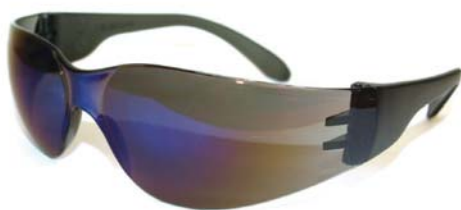
GLAWABLUEMIR Blue mirror lens safety glasses