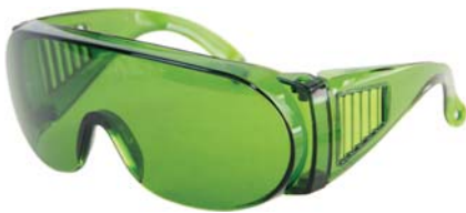
GLAGREEN Green Polycarbonate Safety Glasses.

Green lens glasses. Wrap-around, scratch resistant, 99% UV resistance.