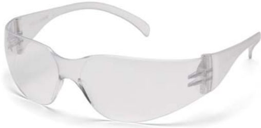
GLAM110ST Clear lens safety glasses