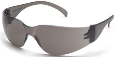
GLAM120S Grey lens safety glasses