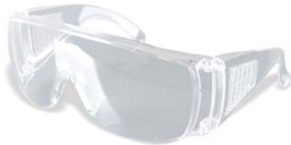
GLAM210S Safety Overglass - Clear Lens.

Medium Impact Eye Protector. Anti-scratch and anti-fog, 99.9% UV Protection. Meets AS/NZS 1337.