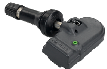
Snap-in Valve System

In addition to our standard valve stem, we also offer our clamp-ins in black, titanium grey, and chrome—for an even better match.