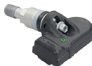
Clamp-in Valve System